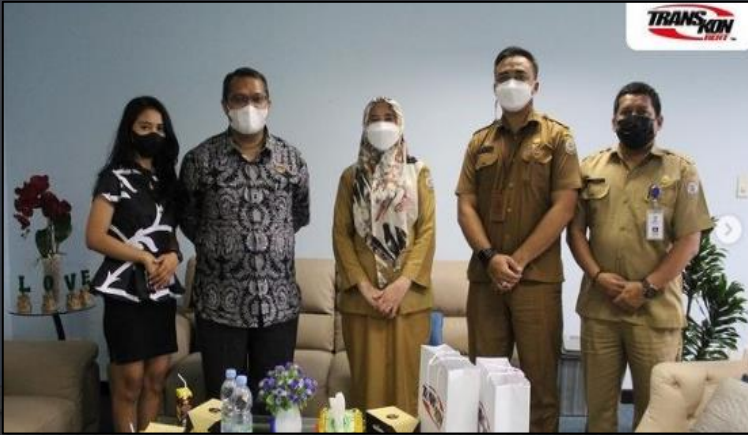
Balikpapan City Manpower Office December 2021