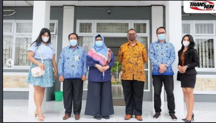
Balikpapan City Industrial Job Training Center October 2021