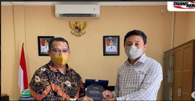
East Kalimantan Investment and One Stop Service Office November 2021