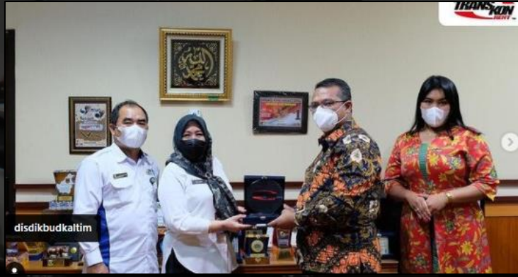
East Kalimantan Province Educational Office November 2021