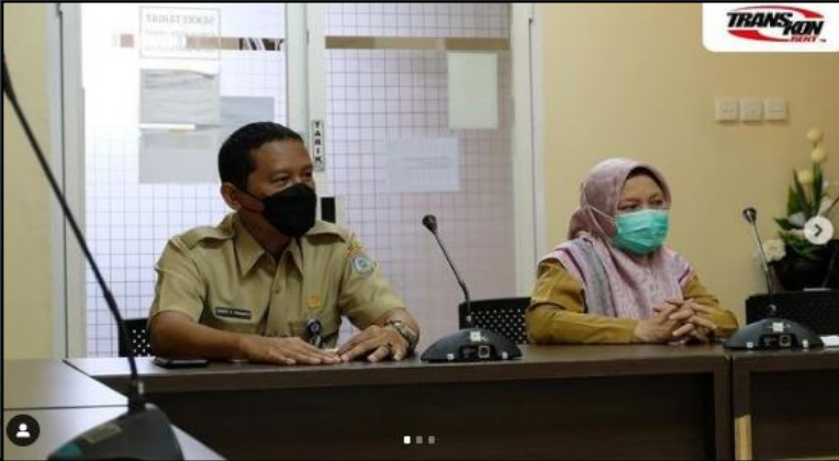
Balikpapan City Environmental Office October 2021