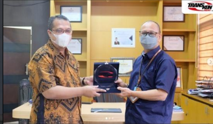
Balikpapan City Cooperative & Industry Cooperative Office November 2021