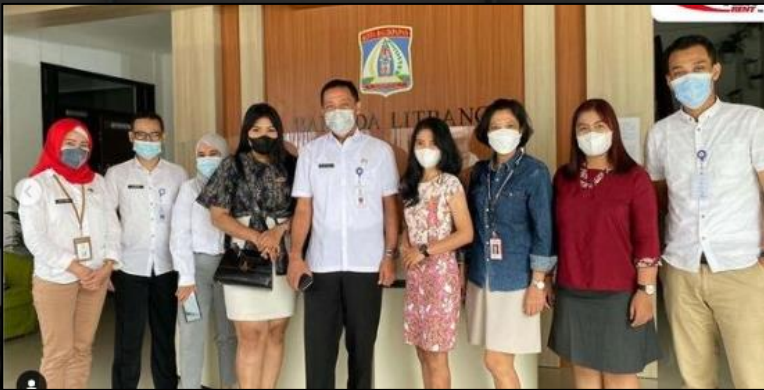
Balikpapan City Planning, Regional Development and Research Office November 2021