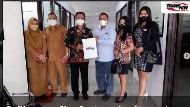
Balikpapan City Communication and Information Office November 2021