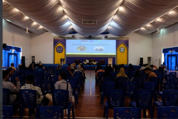
Seminar Bedah Emiten With Universitas Muhammadiyah Gorontalo – December 2021