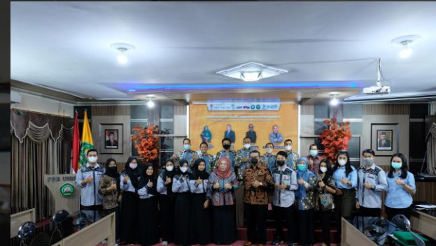
Seminar Bedah Emiten With KSPM Universitas Islam Malang – December 2021