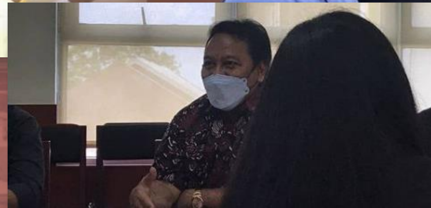
Discussing about Sustainability Report Curriculum