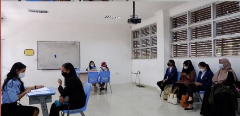
Job fair for STIEPAN alumni